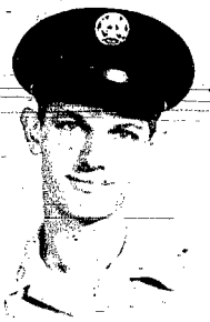
ing at the Air Training Command, Lackland AFB, Tex.