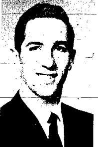
training at Ft. Leonard Wood, Mo., enlisted for four years in the U. S. Army Security Agency.